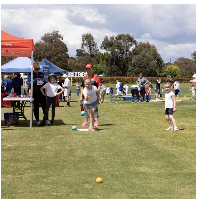
A young participant at the Sunday Funday.

The only disappointing aspect of the day, was that no male members assisted with the event, despite only a handful being tied up with the final day of competition at the bowls club on the day.